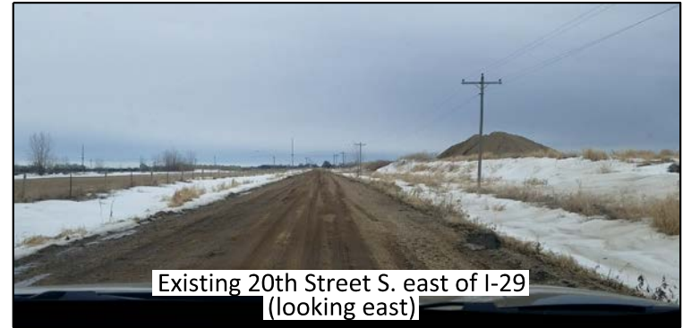
Existing 20th Street S. east of I-29 (looking east)