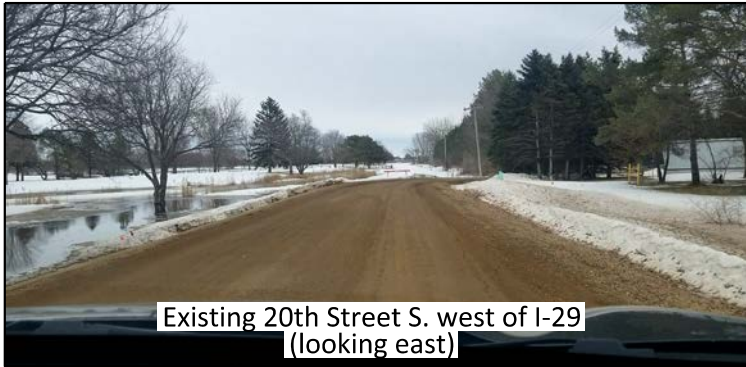
Existing 20th Street S. west of I-29 (looking east)