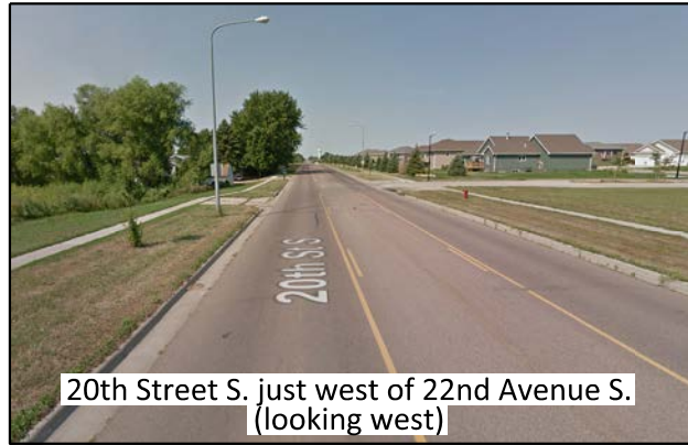
20th Street S. just west of 22nd Avenue S. (looking west)